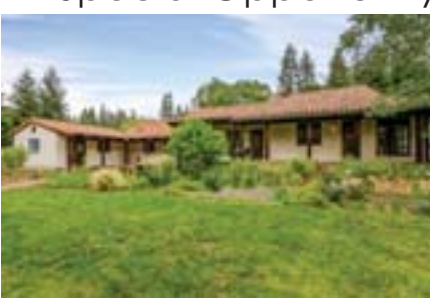
1146 Upper Happy Valley, Lafayette

The Essence of Early California Flat Property in Happy Valley A Special Opportunity