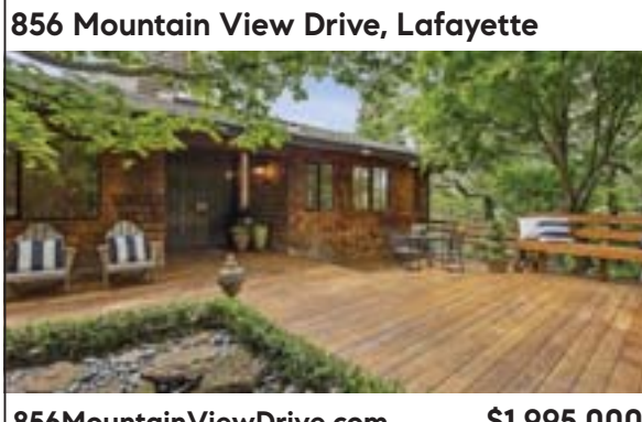
856MountainViewDrive.com 5 Bedroom + Bonus + Office | 4.5 Bath 4004± Sq. Ft. | .53± Acre Lot